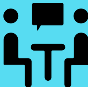
Created by Creative Stall from Noun Project